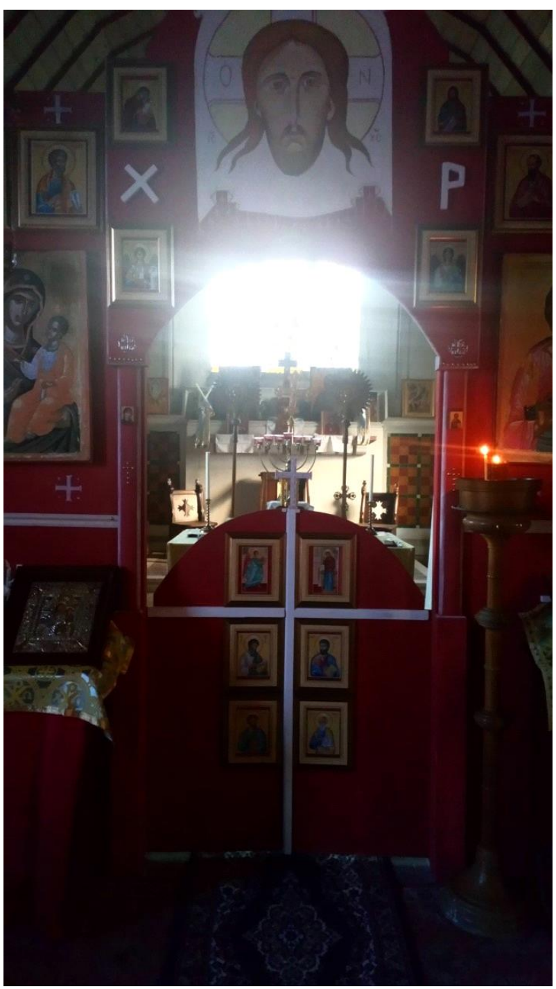
Oraia Pili, looking into the Holy Altar, 27<sup>th</sup> October 2018

damnedest but completely failed to dispirit us - our electricity supply failed (it didn't properly work again until 11<sup>th</sup> January 2015!), holy eikons fell down, and the temperature <u>inside</u> the holy temple remained at a toasty -1° Centigrade!