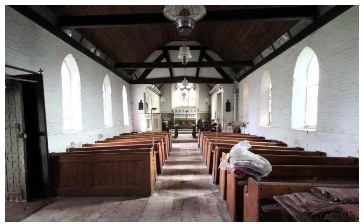
All Saints, as it was before the Orthodox arrived - quite unrecognisable today!