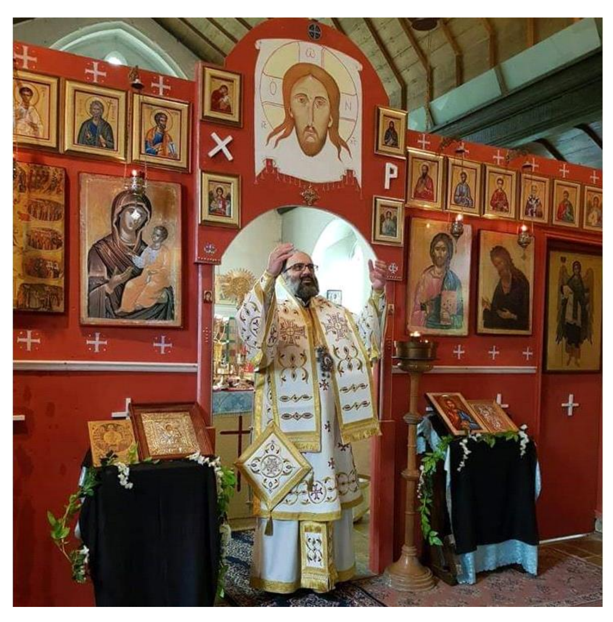
H.E., Archbishop Silouan, serving Hierarchical Divine Liturgy at All Saints, 1st April 2019