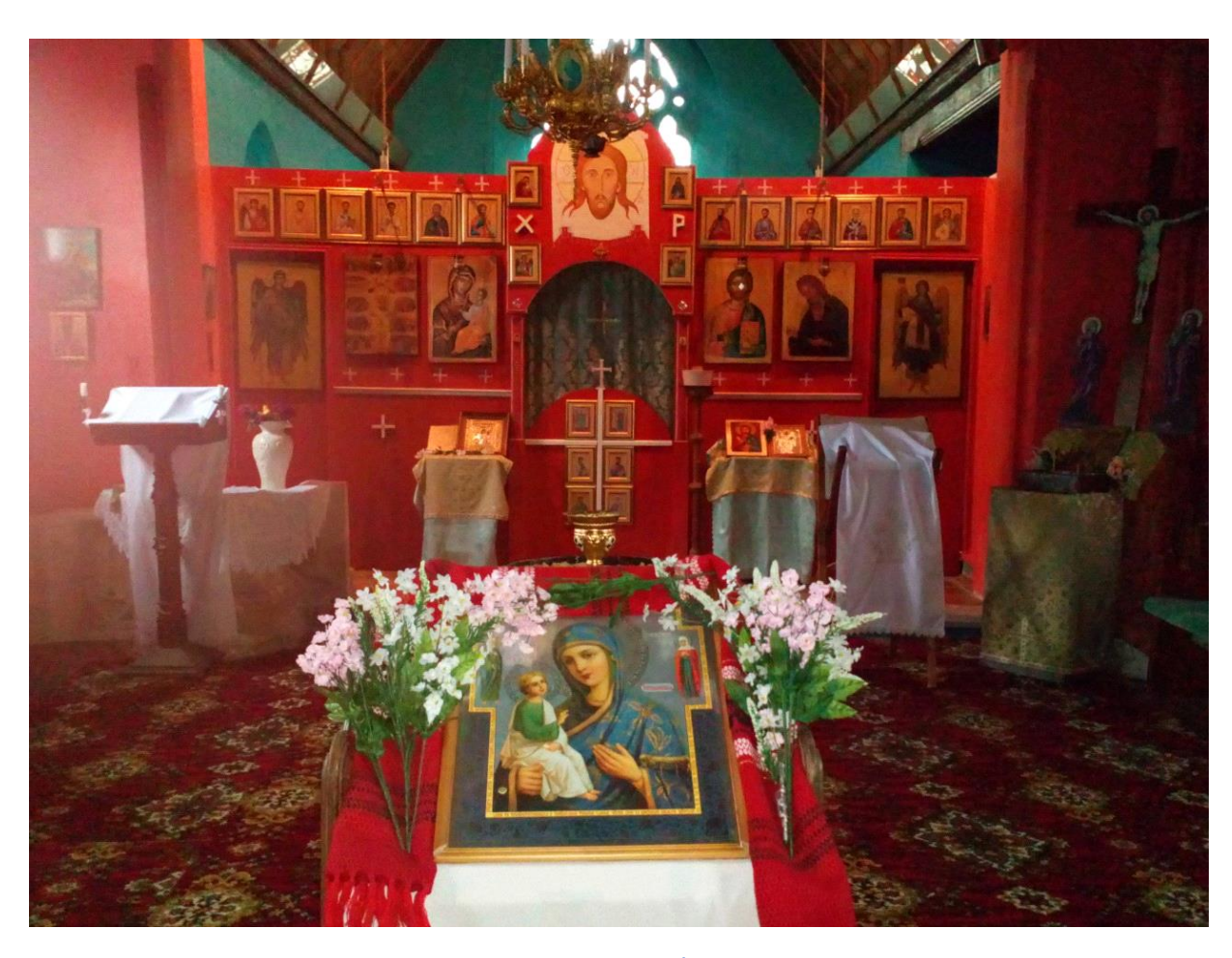
The Nave at All Saints, 4th October 2020