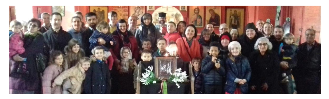
Holy Annunciation, 25<sup>th</sup> March 2018