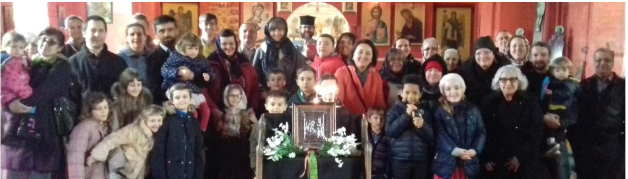
Holy Annunciation, 25 th March 2018