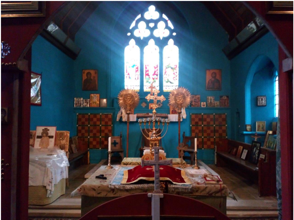
The Holy Altar at All Saints, 4 th October 2020