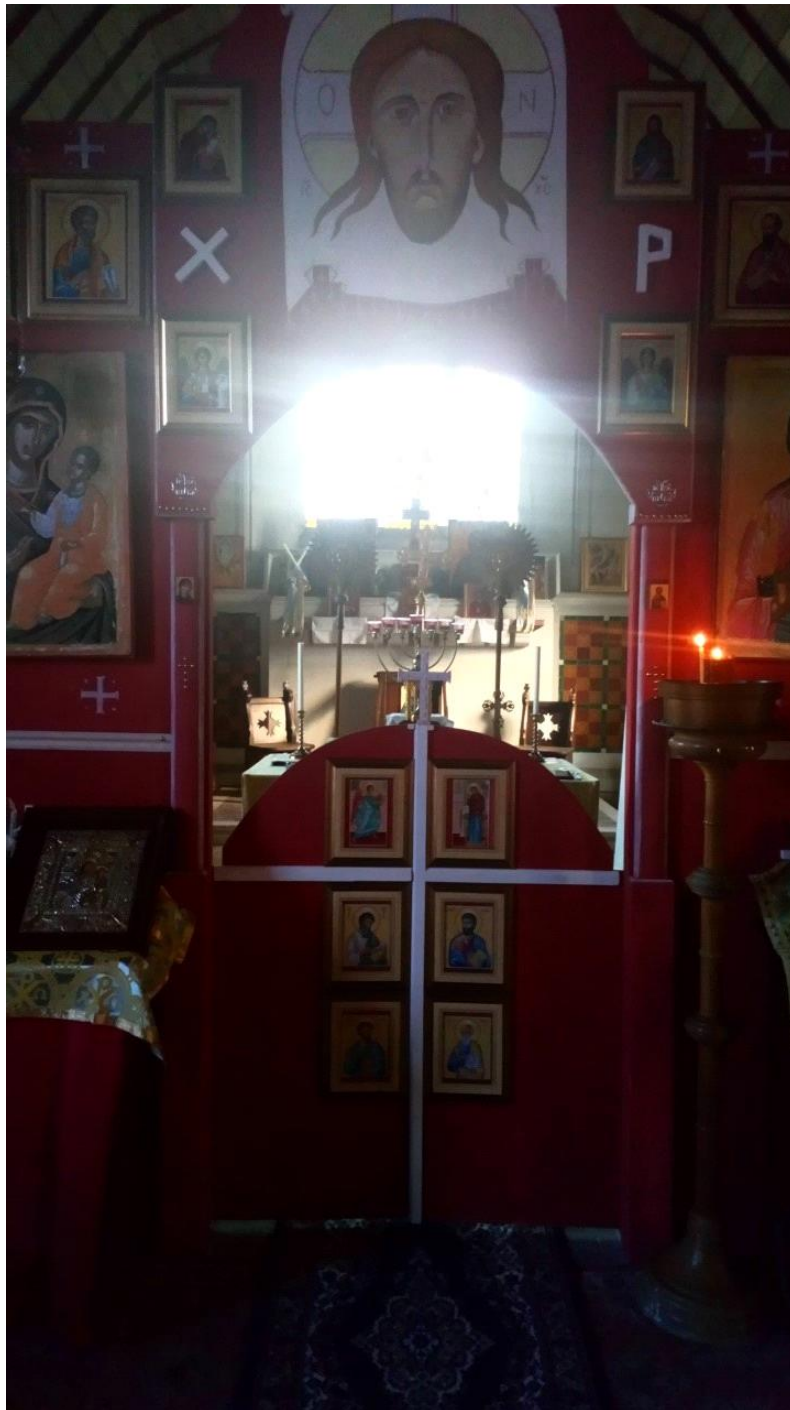
Oraia Pili, looking into the Holy Altar, 27 th October 2018

damnedest but completely failed to dispirit us - our electricity supply failed (it didn't properly work again until 11 th January 2015!), holy eikons fell down, and the temperature inside the holy temple remained at a toasty -1° Centigrade!