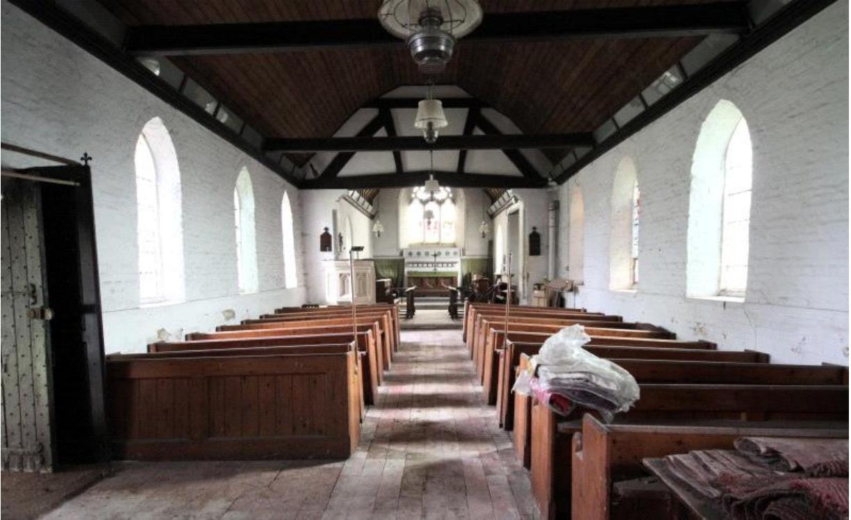
All Saints, as it was before the Orthodox arrived - quite unrecognisable today!