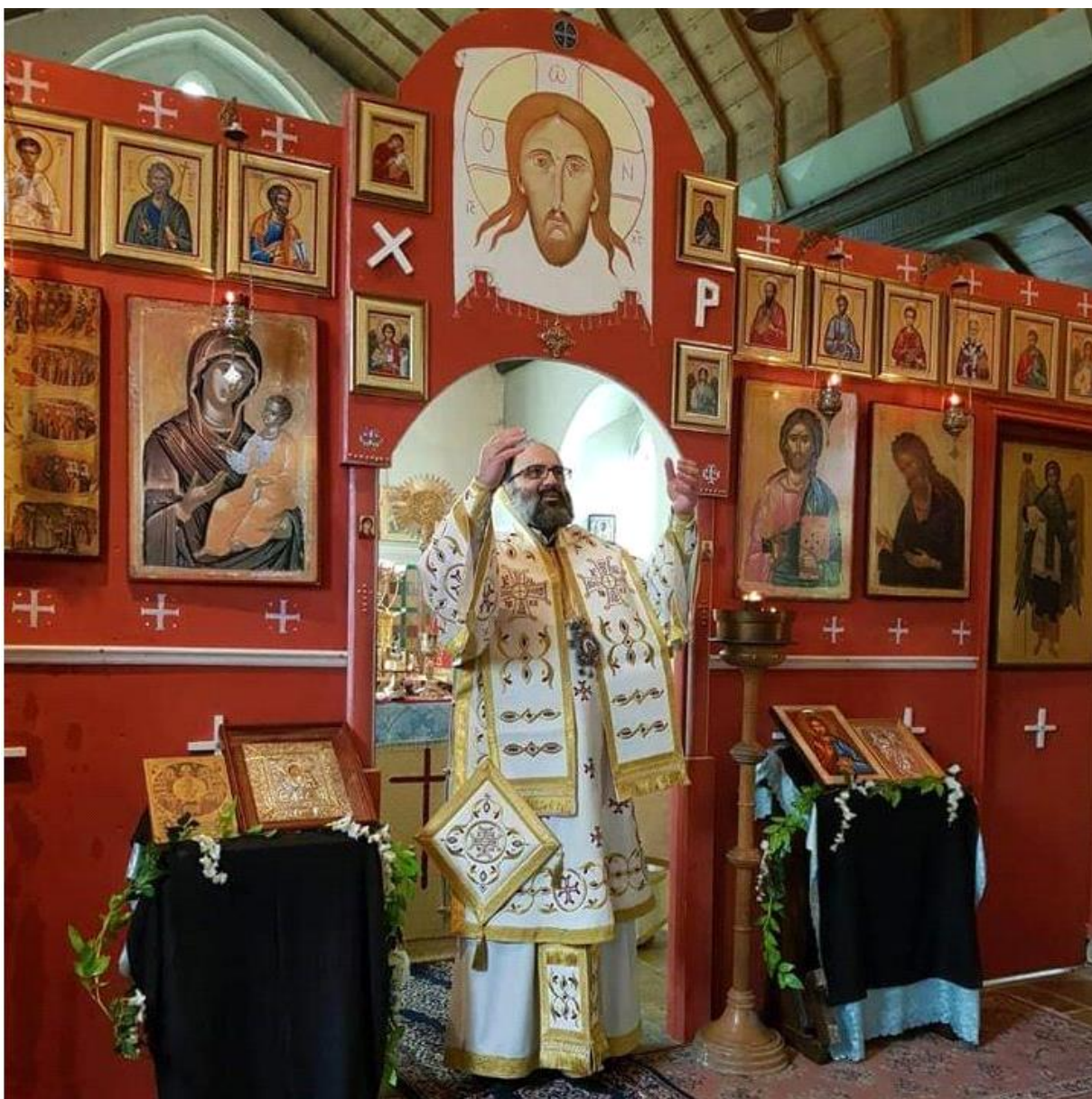
H.E., Archbishop Silouan, serving Hierarchical Divine Liturgy at All Saints, 1 st April 2019