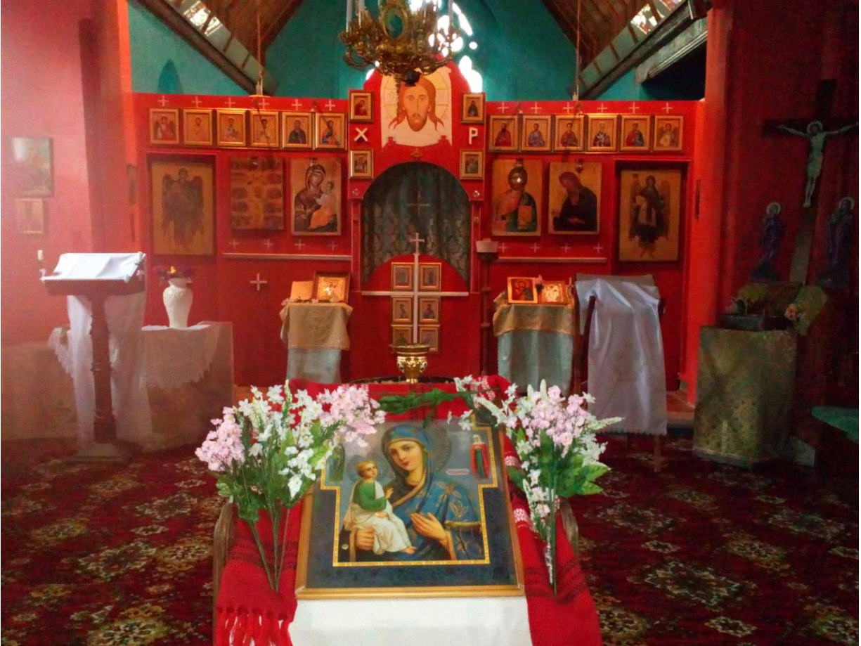
The Nave at All Saints, 4 th October 2020